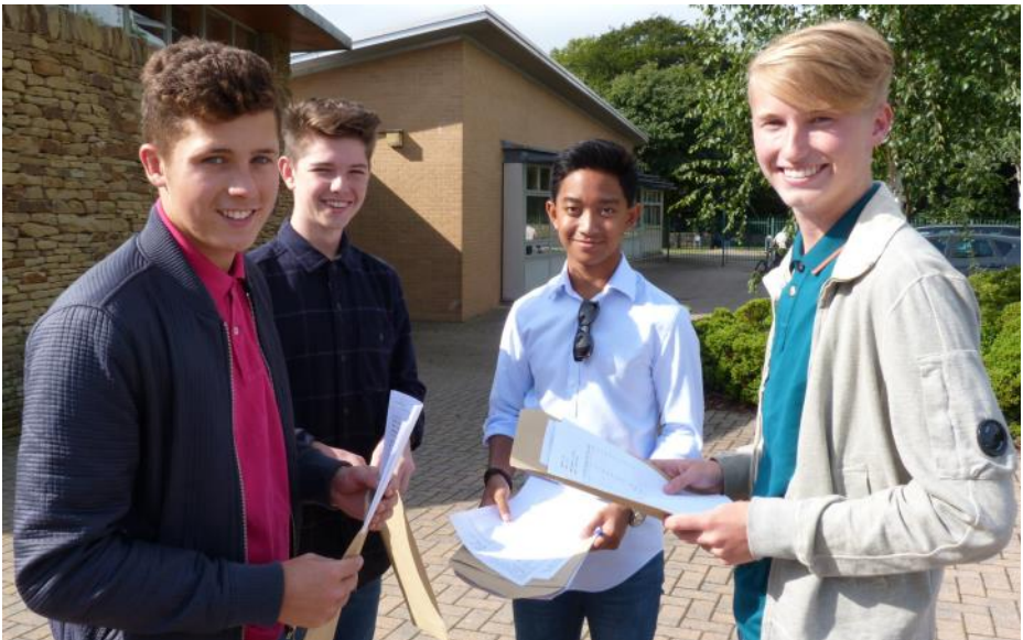
There were many smiling faces on 20 August, GCSE Results Day

Examination results of our Year 11 leavers this summer confirm the judgements made by Ofsted inspectors when they praised the high standards achieved by pupils here.